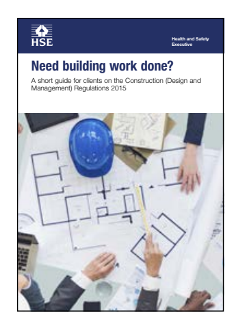
This is a web-friendly version of leaflet INDG411(rev1), published 04/15

A short guide for clients on the Construction (Design and Management) Regulations 2015